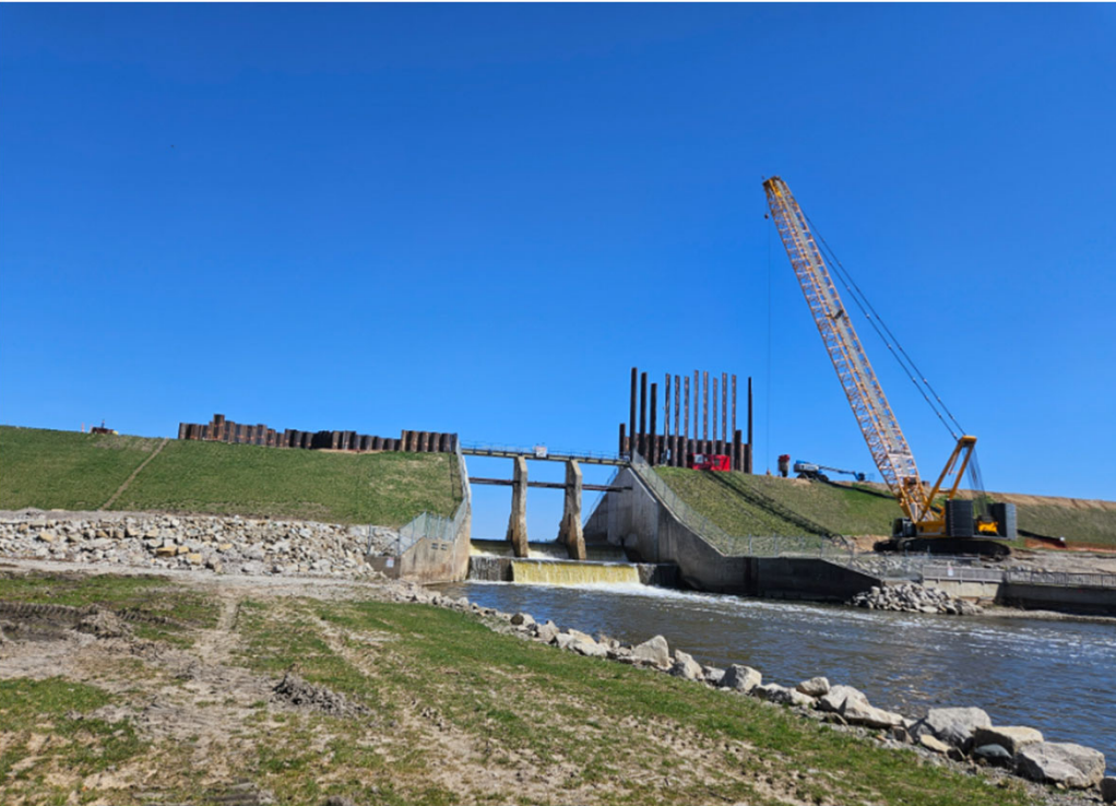
Sheet Pile Installation – Looking North on Tobacco Spillway