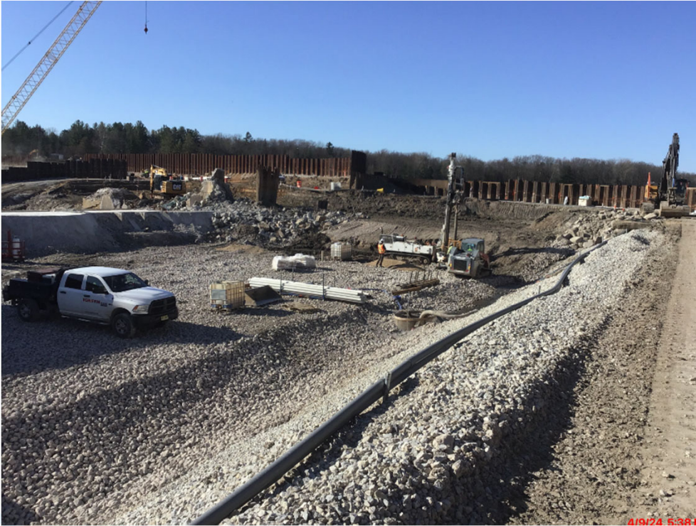
Upstream Spillway Area for Construction Logistics – Looking Northwest