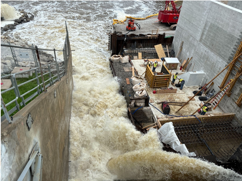
Forming downstream baffle blocks in Bay 1 of Primary Spillway