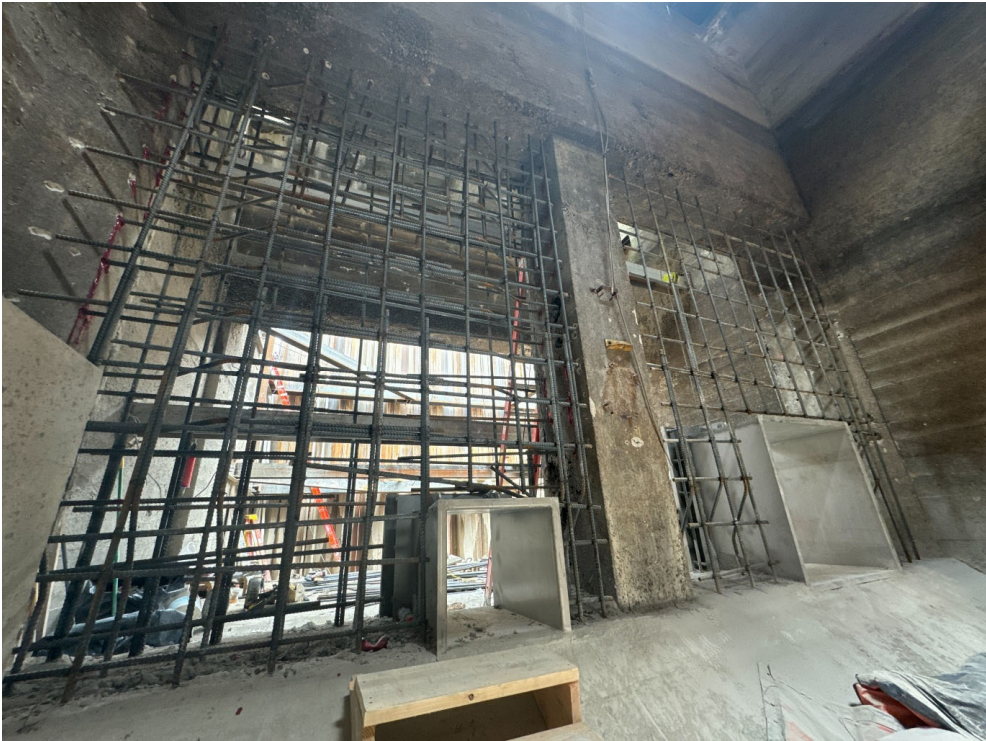
LLO slice gate installation