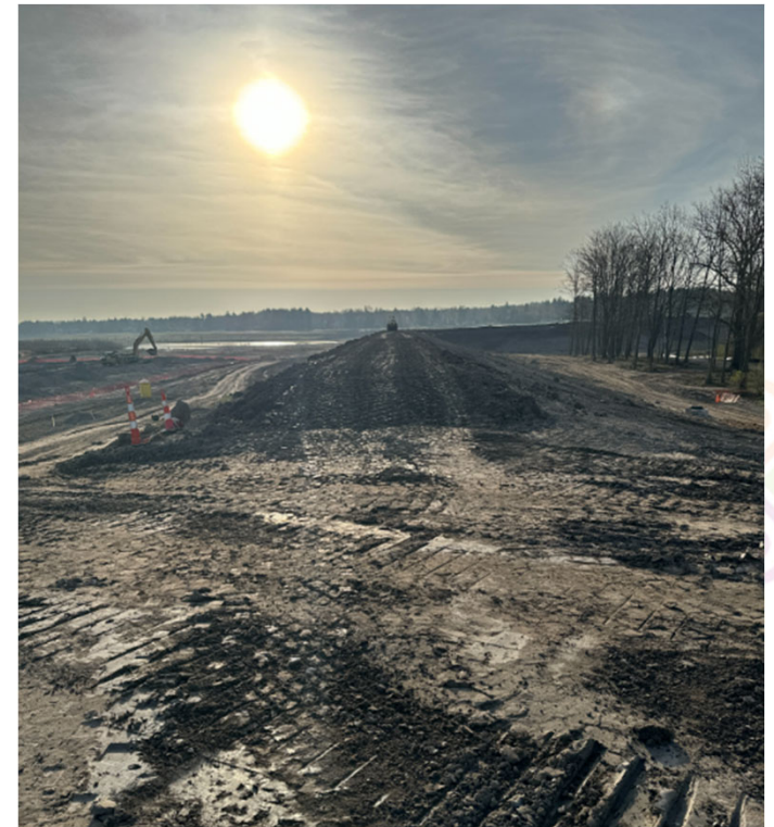
Embankment Restoration – Looking East