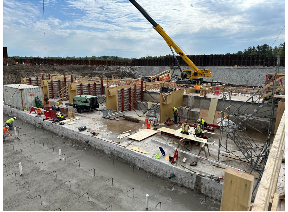
Primary Spillway – Forms Being Placed For Piers – Looking North