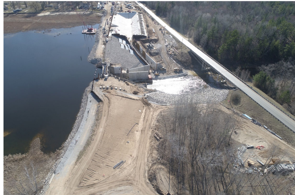
Secord Dam – Looking East

The Best Alternative is to Restore the Dams and Lakes