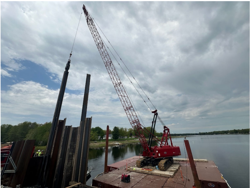
Upstream Cofferdam Installation – Looking Northwest