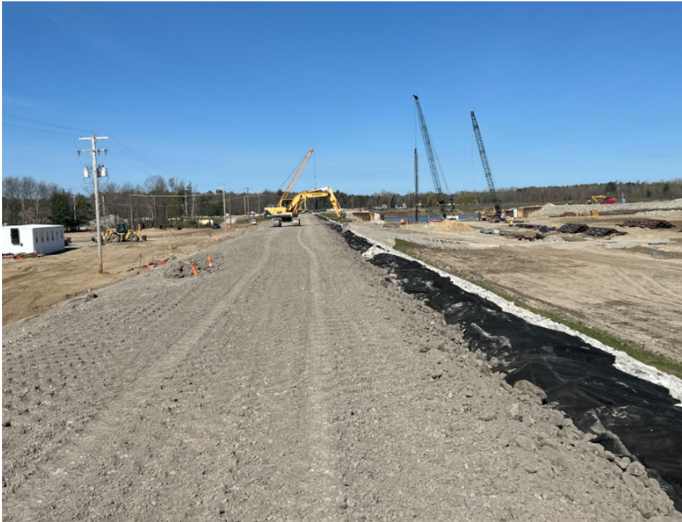
Phase IV – Embankment Restoration – Looking West