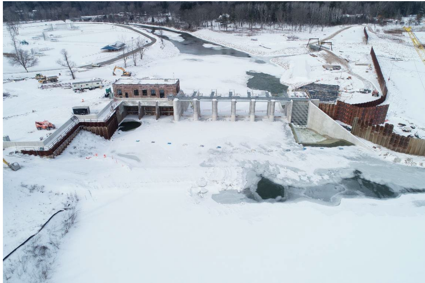
Pictured: Sanford Dam looking downstream. Upstream steel sheet pile removed. Taken Feb. 14, 2025.